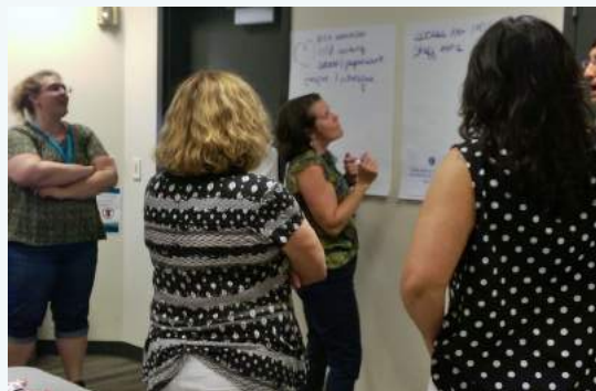
Coeur d'Alene District