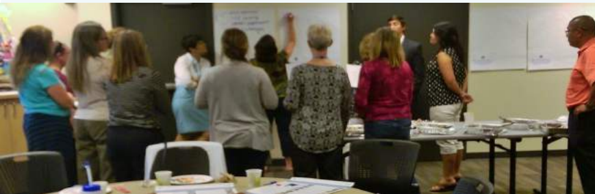
Coeur d'Alene District